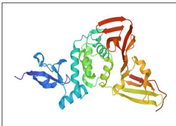
Fig. 1. PLpro 3D Structure

The PDB code of the downloaded PLpro protein is 6WX4. This data is in the form of experimental data from X-Ray Diffraction which contains coordinate data on the three-dimensional structure of the PLpro protein with Chain: A and Resolution: 1.66 Å. The selection of the PDB code must also comply with the rules in receptor determination, namely resolution \leq 3 and on the Ramachandran plot > 90\% of the amino acid residues are in the most favored regions. Figure 1 shows the 3D structure of the PLpro protein.