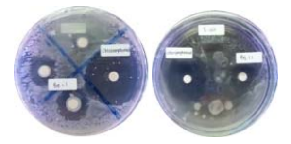
Figure 1. Antibiosis Test of Bacterial Isolates with Test Bacteria

The antibiosis test was carried out to observe and measure the inhibition zone of bacterial isolates from fish processing wastewater against the test bacteria. According to Surdjowardjojo et al., (2015) there are three categories of inhibition zones, namely inhibition zones less than 5 mm ( \leq 5mm) including the weak category, inhibition zones in the range of 6-10 mm including the medium category and those in the range of 11-20 mm including into the strong category. The antibiosis activity of the bacterial isolate Bacillus subtilis soil strain G2B against the test bacteria can be seen in Figure 1.