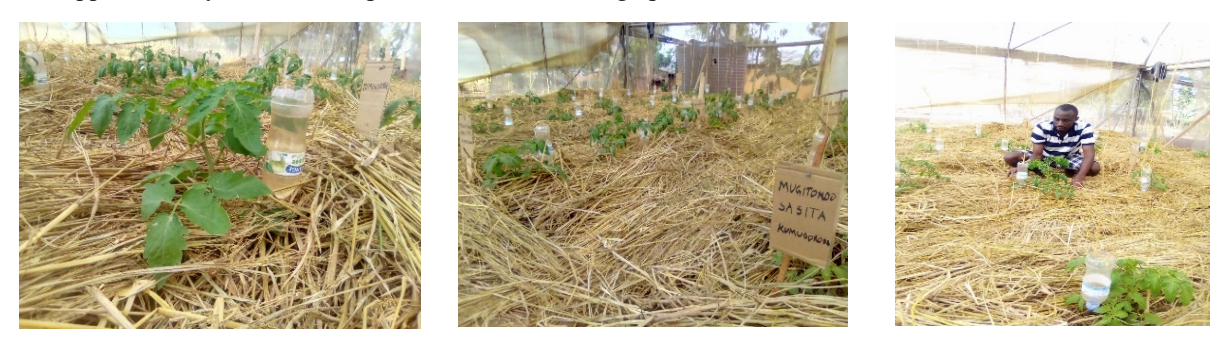
Figure 3 the photos above shows the current experiment field status

Half litre cool drink plastic bottles with lids were used to store water and provide water to the tomato plants. Small holes were drilled into the cap of the plastic bottles which aimed to discharge water from the holes of approximately 2 litres per hour. The bottom of each bottle were removed to enable the bottles to be filled with water. A hole was dug next to each plant and the bottle buried approximately one-third deep with the bottom facing up.