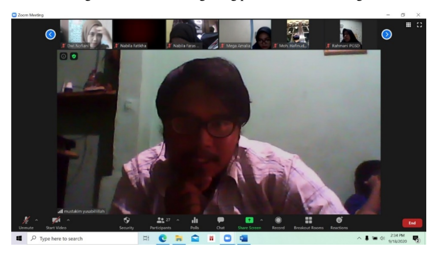
Figure 3. Discussion the problem solving

The ability to solve problems is needed by someone to achieve certain goals and to find solutions. A student has a duty to become an individual who always carries out positive activities such as discussing, studying, expressing arguments during deliberations or presentations, asking questions, bringing up various innovations, developing creativity, critical thinking, and good time management appropriately. When students can do this, they will be able to solve the problems they face well. Based on the results of the study, it shows that the implementation of online learning can improve students' ability to solve problems. This happens because online learning activities through zoom meetings emphasize the interaction and channeling of information that makes it easier for students to improve the quality of their learning. In online learning using zoom meetings, frequent discussions are held which requires students to be actively involved in asking, answering, and arguing on the issues being discussed.