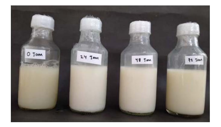
Fig 2. Jackfruit seed probiotic drink with different fermentation time

Table II shows that there is an increase in the length of fermentation time that affects the level of preference for taste, colour, and aroma. The highest average value at the level of preference for the colour preferred by the panelists is 3.26 (likes) where the preferred colour is whiter than other fermentation times. The white colour is caused by degradation of the yellow pigment during fermentation [8]. Jackfruit seeds contain carotene pigment which is the main component of the yellow colour in jackfruit seed extract, pH stability affects the color produced by carotenoids so there is a change in colour with longer fermentation due to a decrease in pH [22], [23]. The results of physical observations on the probiotic drink jackfruit seed extract are shown in Figure 2.